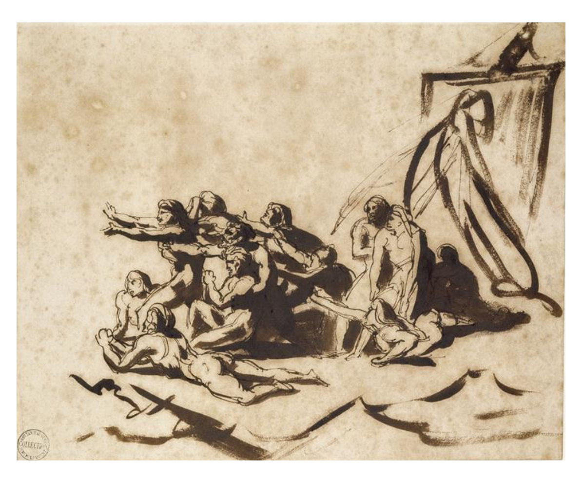
Plate 10, Géricault, The Survivors hailing the approaching rowboat (Rouen, Musée des Beaux-Arts)