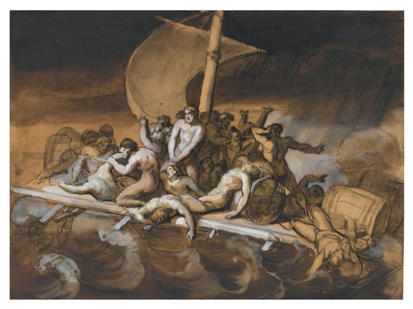
Plate 8 Géricault, Despair and Cannibalism on the Raft (Paris, Gobin collection)