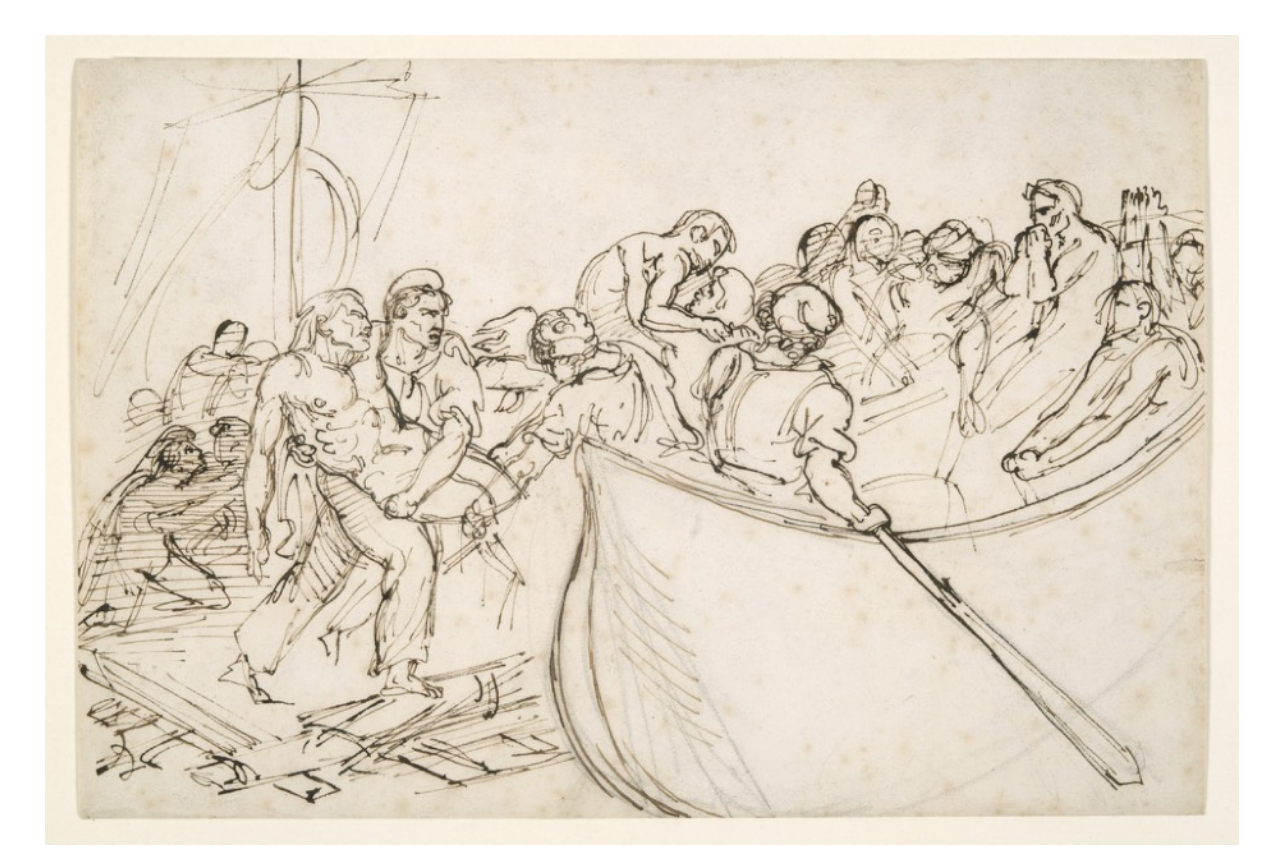
Plate 1: Géricault, <u>The Rescue of the Survivors</u> (unknown collection/museum) (this is a slightly different version from the one described in the text, reversed L-R)