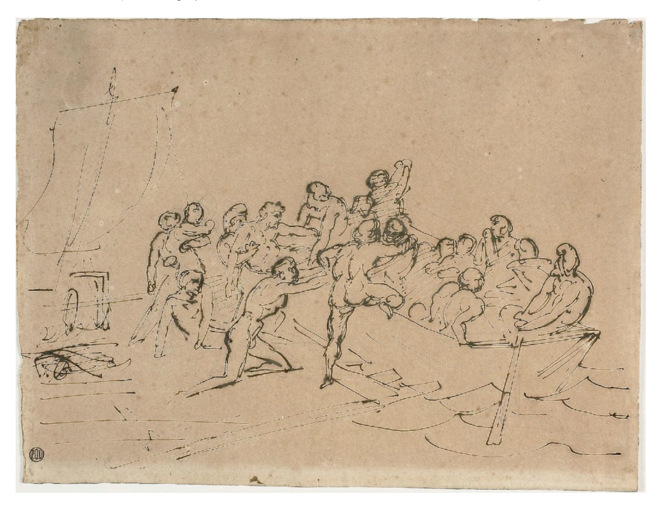
Plate 2: Géricault, The Rescue of the Survivors (Paris, Dubaut collection)