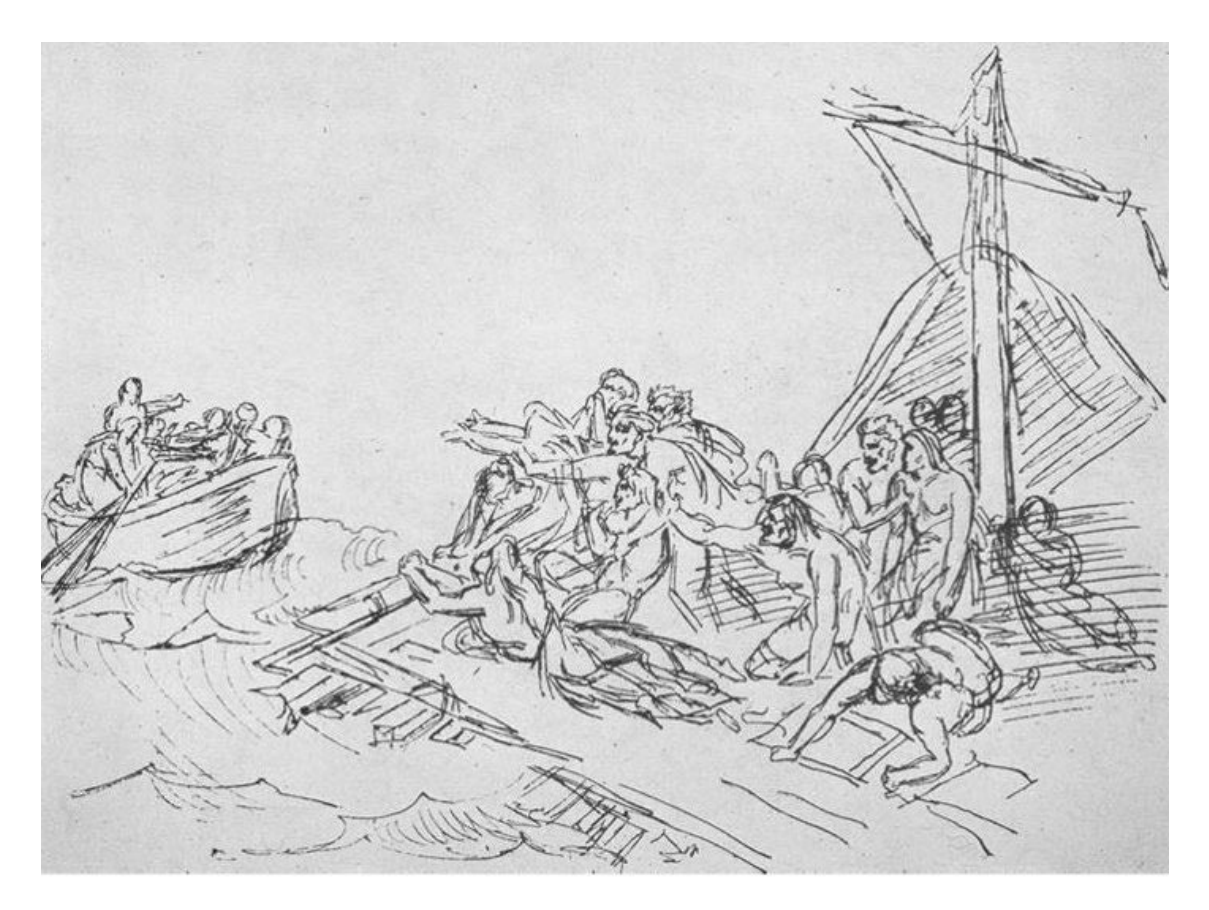
Plate 9 Géricault, The Survivors hailing the approaching rowboat (Paris, Marcille collection)