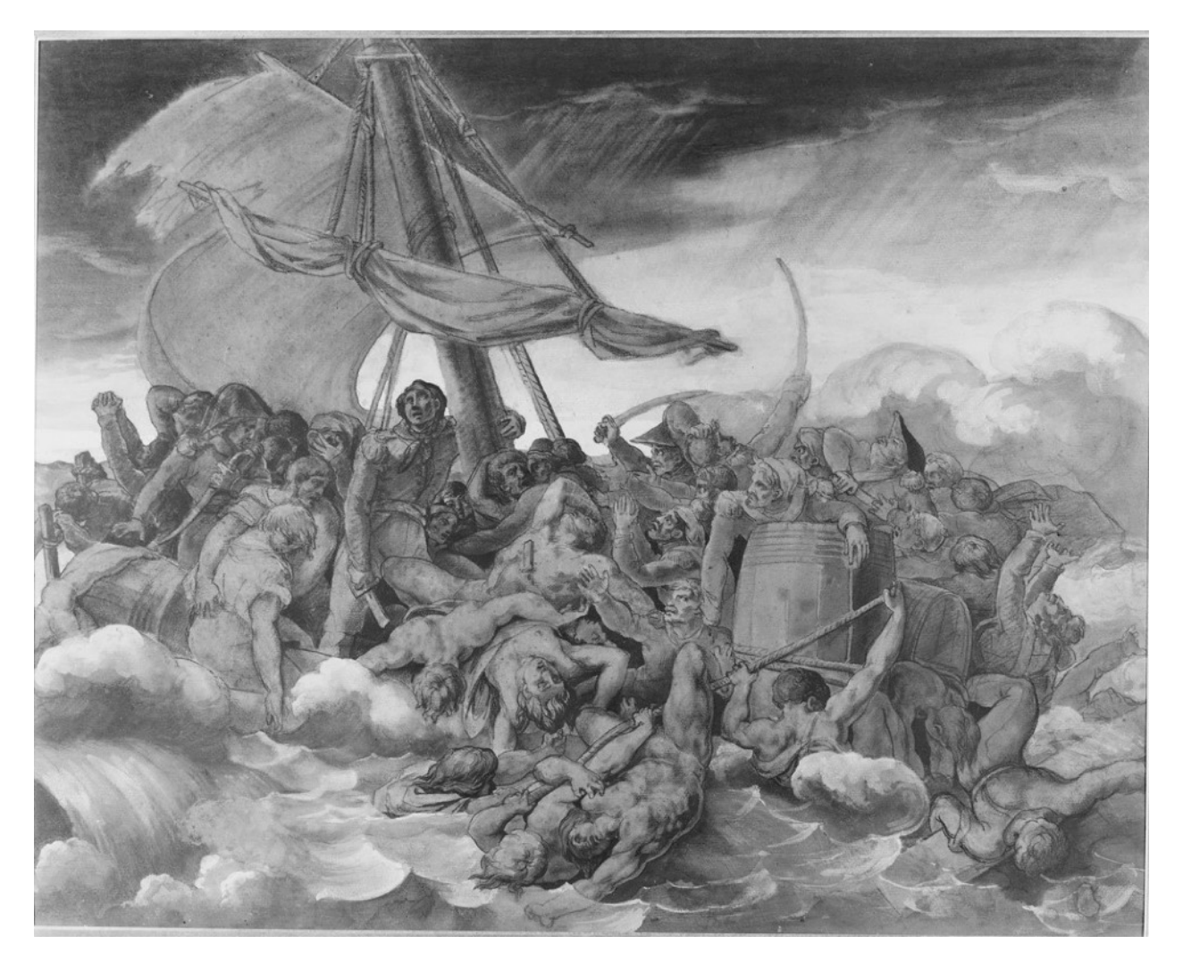
Plate 7 Géricault, The Mutiny on the Raft (Massachusetts, Fogg Art Museum)