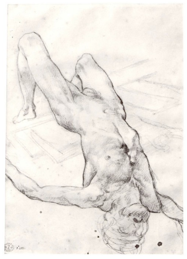
Study for a figure with leg trapped, falling off the raft

Plate 86 Four studies of a severed head (Paris, Dubaut Collection)