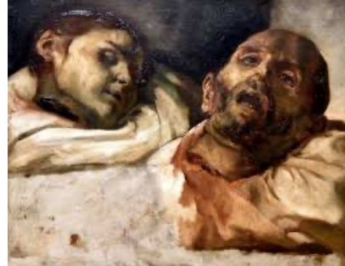
Plate 87 Studies of severed heads