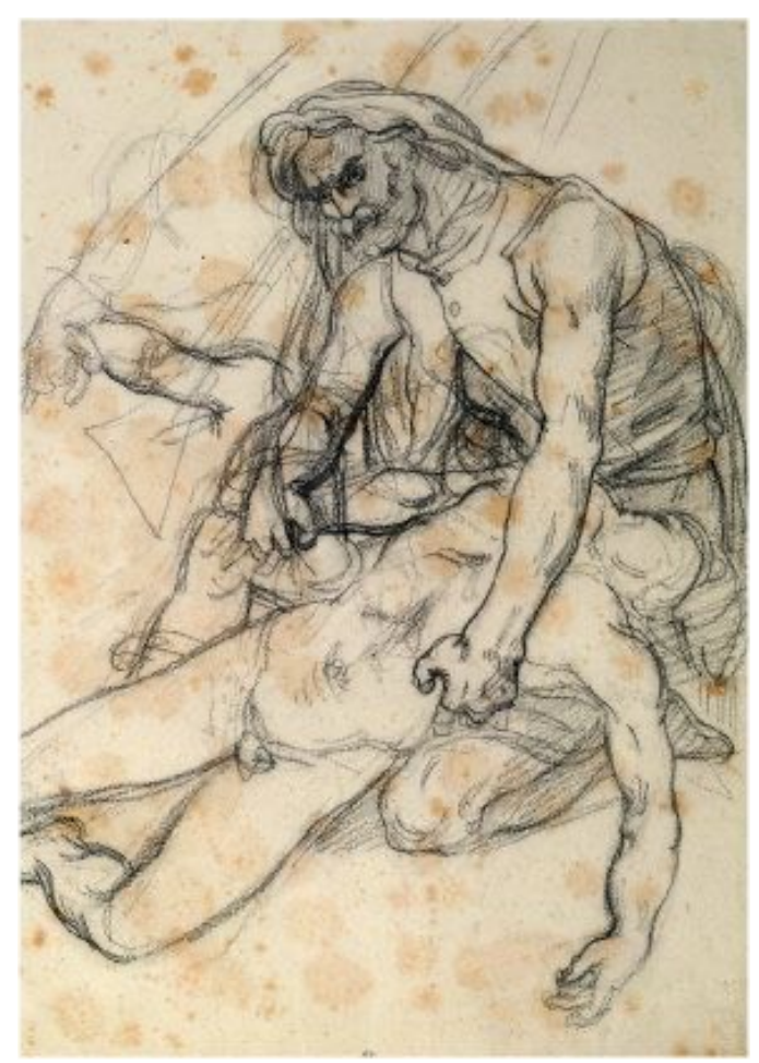
Plate 22, Father holding his dead son