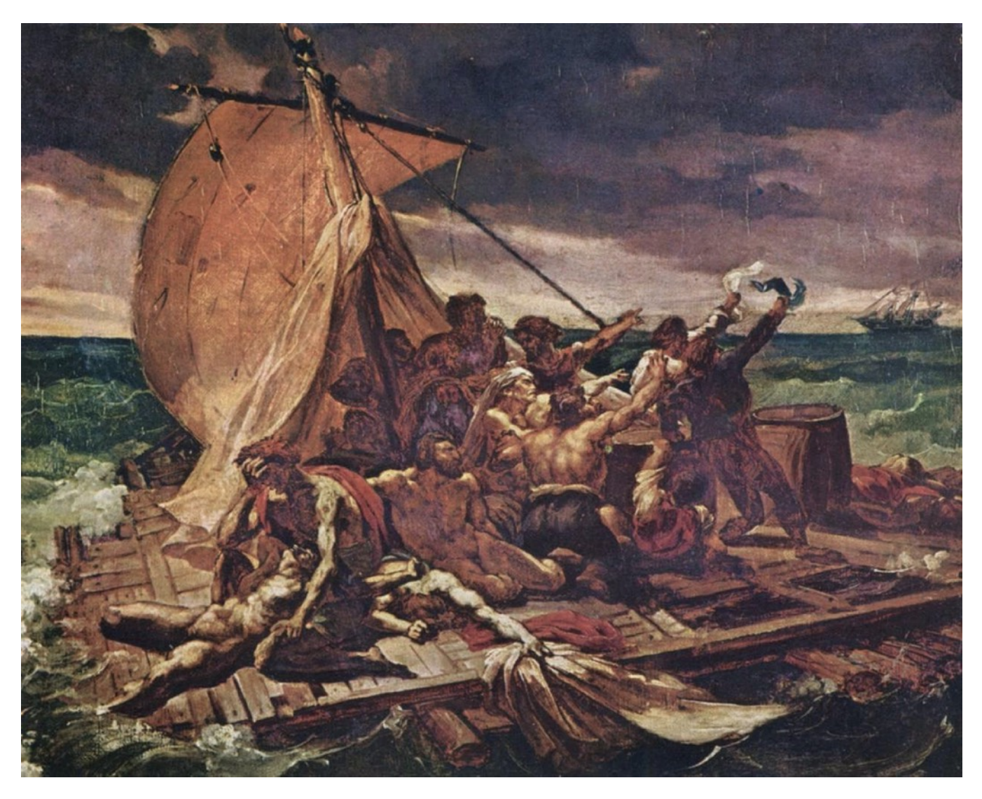
Plate 16 Géricault, The Sighting of the distant Argus (Paris, Louvre, ex-Schickler collection)