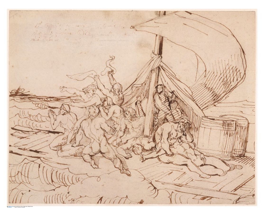
Plate 14 Géricault, The Sighting of the distant Argus (Lille, Palais des Beaux-Arts)