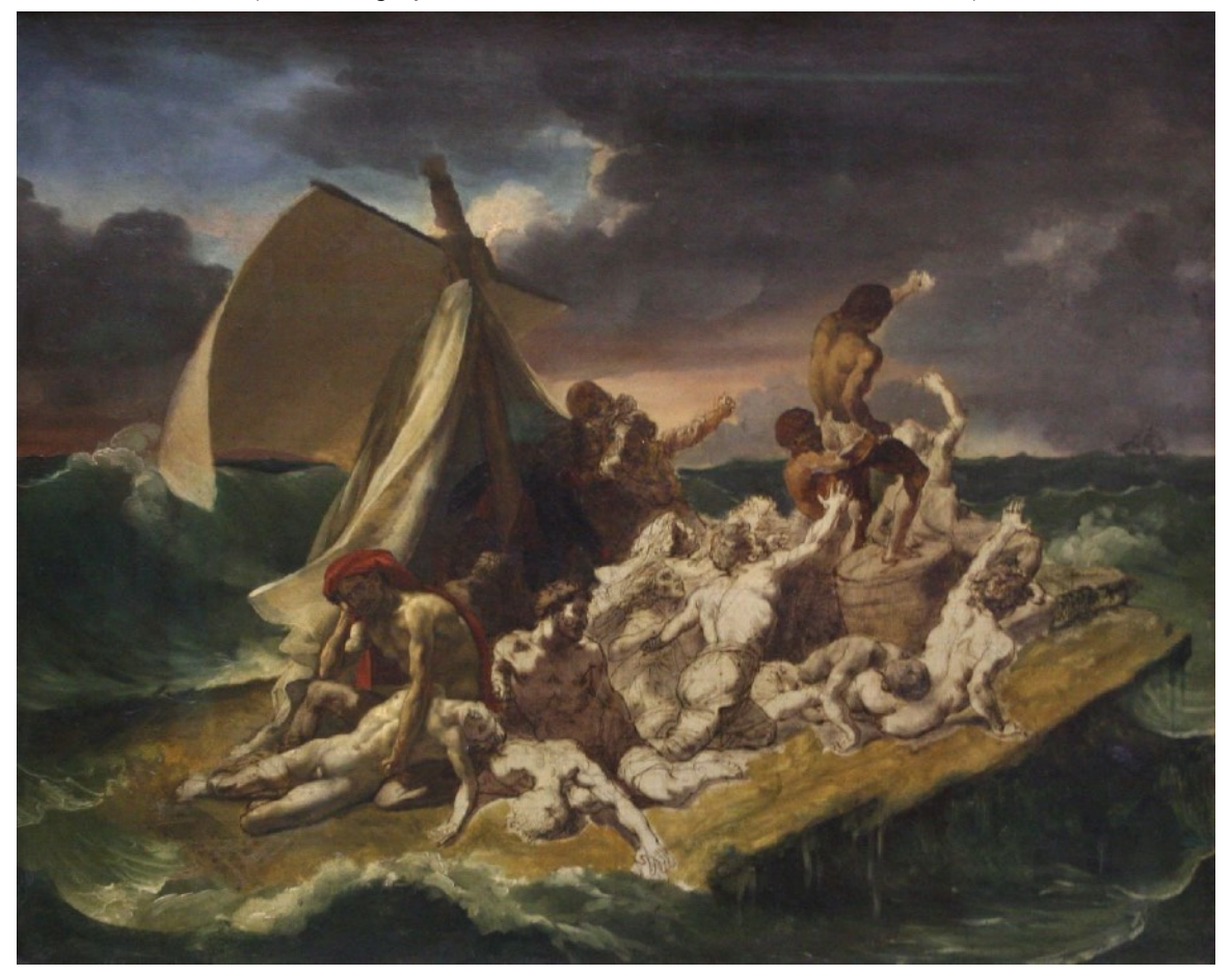
Plate 21 Géricault, <u>The Raft of the Medusa</u>, near-final composition (Paris, Louvre, ex Moreau-Nelaton collection)