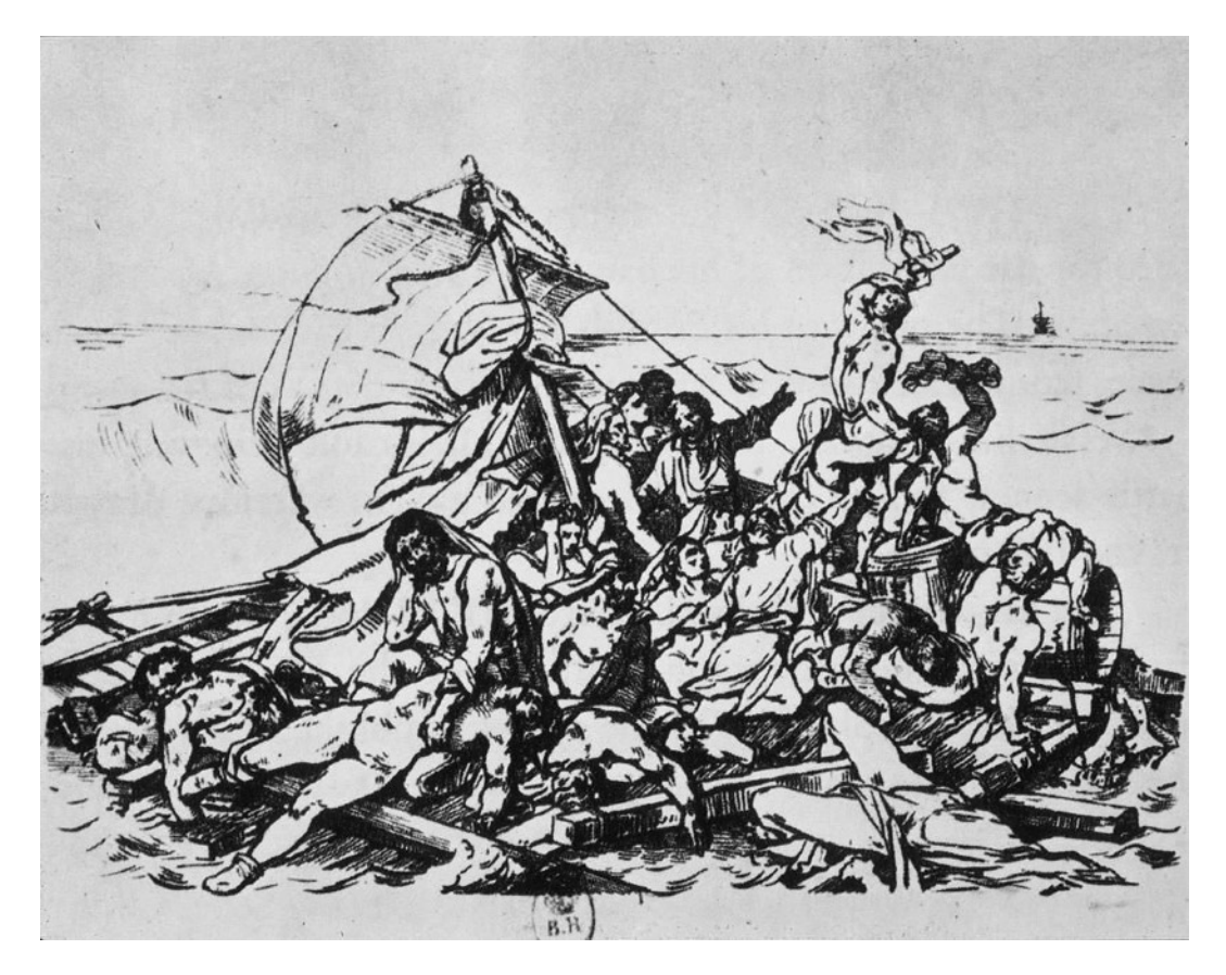
Plate 19, Géricault, <u>The Raft of the Medusa</u>, near-final composition, pen and ink study (this is a slightly different version from the one referred to in the text)