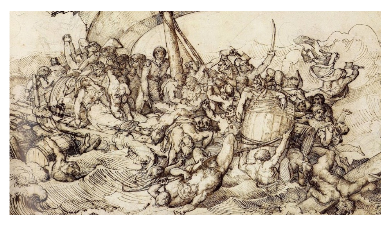
Plate 6. Géricault, The Mutiny on the Raft (Amsterdam, Stedelijk Museum), slightly cropped at the top