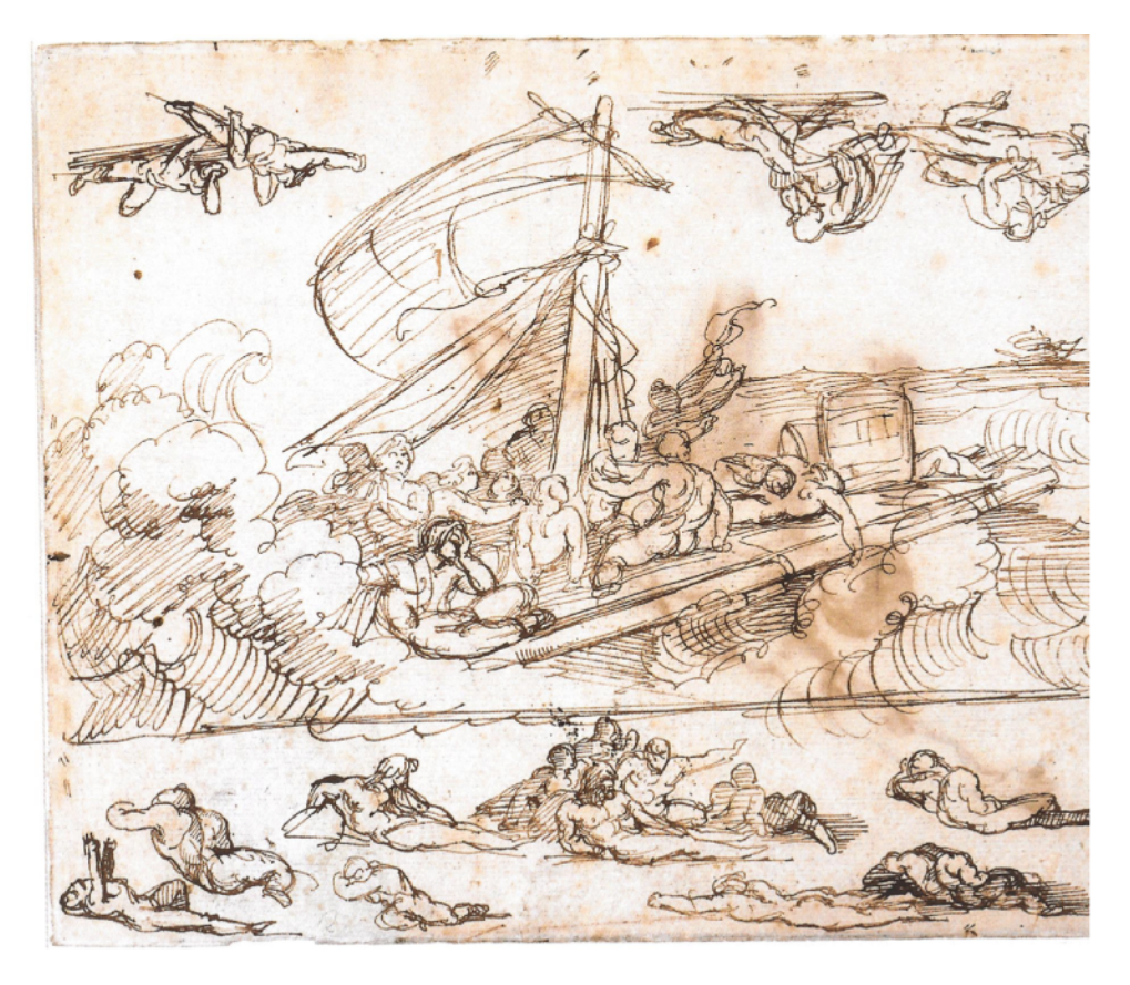
Plate 13 Géricault, The Sighting of the distant Argus (Rouen, Musée des Beaux-Arts)